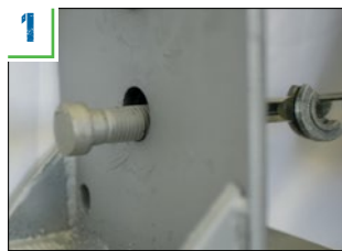
1 Install the bolt into the hole followed by the collapsible washer.