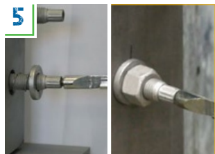
5 Slide the face washer forward and move the nut up to fasten to the bolt. Tighten the nut snug tight at this point.