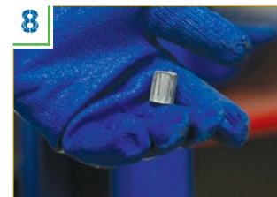
8 Press the small trigger on the shear wrench to eject the bolt spline. The application is now complete.