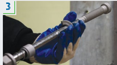
3 Move the collapsible washer to the correct location on the tool and fold in place.