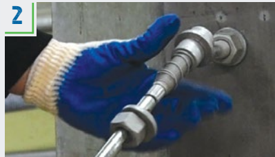
2 Remove the nut, the face washer and the spring shear sleeve and side along the handle of the tool.