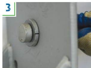
3 Pulling back, rock the tool side-to-side to engage the collapsible washer.