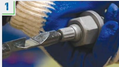
1 Thread the installation tool tip into the splined end of the bolt.