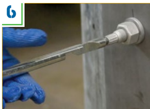
6 Remove the tool by unscrewing it from bolt (counterclockwise).