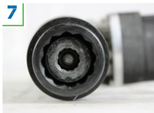
7 Using the shear wrench engage the outer socket with the splined end of the bolt. Press the trigger until correct tension has been achieved (the bolt spline separates from the bolt).